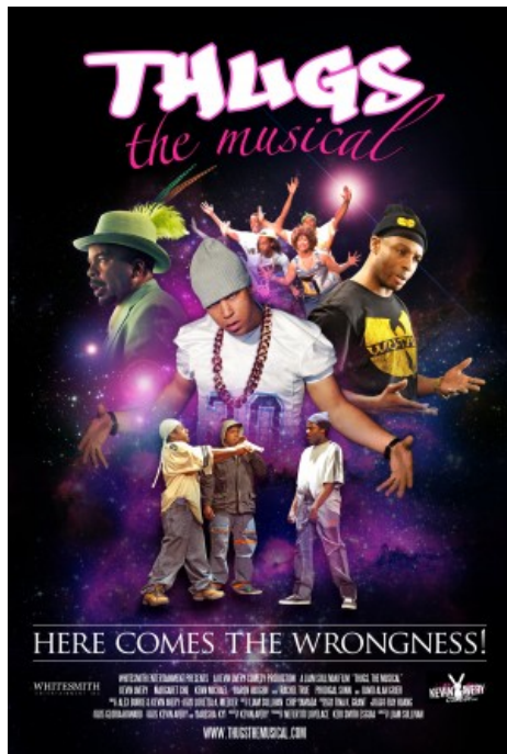
Thugs the Musical Movie Poster

©2012 The Dallas Weekly. All rights reserved. This material may not be published, broadcast, rewritten or redistributed.